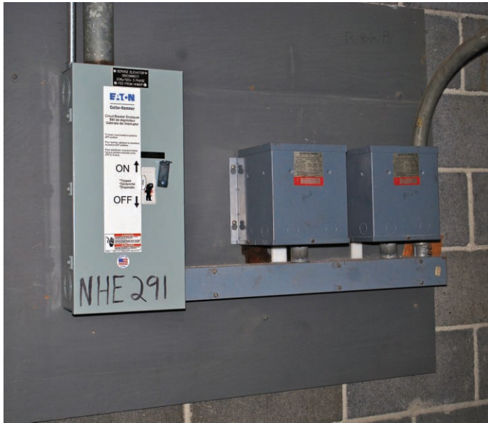
Elevator power disconnect (with utility feed marking) located in the machine room or other permitted location

elevators have a single means for disconnecting all ungrounded car lights, receptacles and ventilation power-supply conductors for that elevator car. The disconnecting means is to be in the machine room or similar location, with provision for being locked in the open position. Similar provisions are attached to elevator-car heating and air-conditioning disconnecting means, and to other utilization equipment.