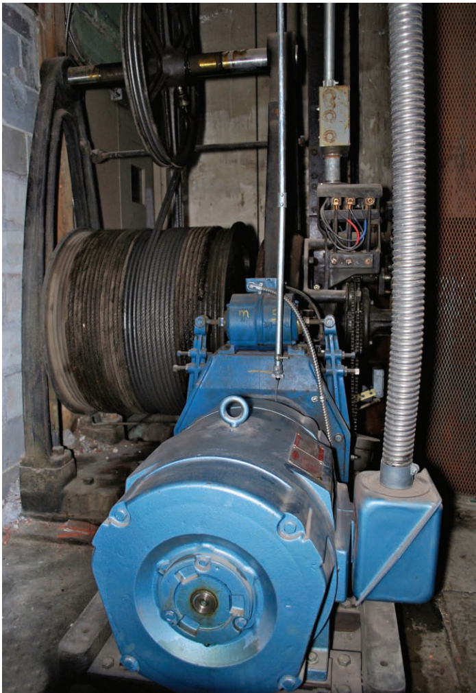
Elevator drive motor: note the flexible metallic conduit as permitted to allow for motor vibration.