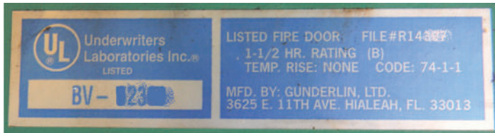
Figure 3: Typical label on the door panel indicating evidence of fire testing

The oven heats the entrance assembly to over 1,800°F (982°C) for a time based on the fire rating desired. In the case of standard elevator entrance assemblies, 1.5 hr. is typical. At these temperatures, all plastic components will melt and burn away, leaving the door panels to be retained in the entrance assembly frame by only the remaining metal safety retainers designed to survive this temperature.