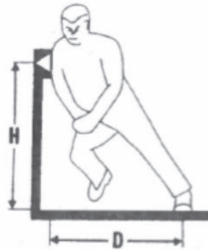
TABLE VII HORIZONTAL PUSH AND PULL FORCES EXERTABLE