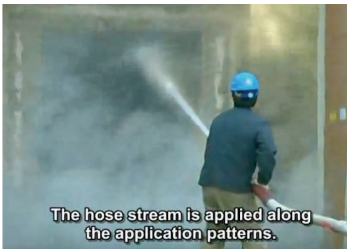
Figure 4: Hose stream test from UL 10B, NFPA 252 and CAN 4-S104

A successfully tested entrance assembly design is then “listed” with the testing laboratory to provide traceability to the testing conditions and assembly components used during the test. Then, the entrance is “labeled” as evidence of successful completion of the test. All listing and labeling requirements in the code have a similar process, just a different standard reference and test procedure.